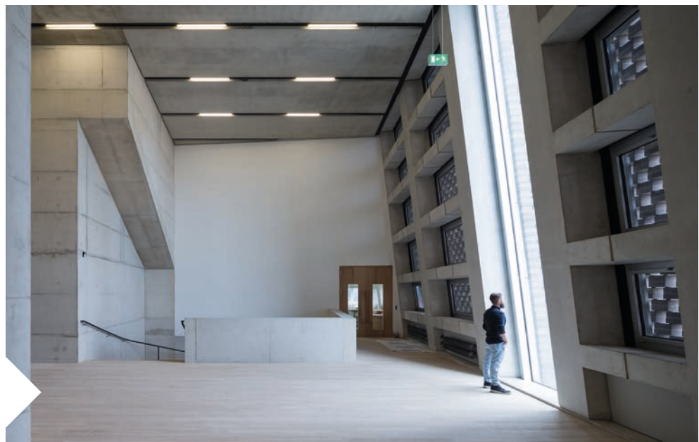
At Tate Modern's Switch House extension in London, a pale-coloured concrete mix containing 50% GGBS cement replacement was used for the precast concrete frame